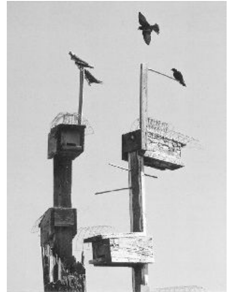
Nest boxes installed on marine pilings are quickly occupied. Les nichoirs installés sur les piliers sont rapidement occupés.