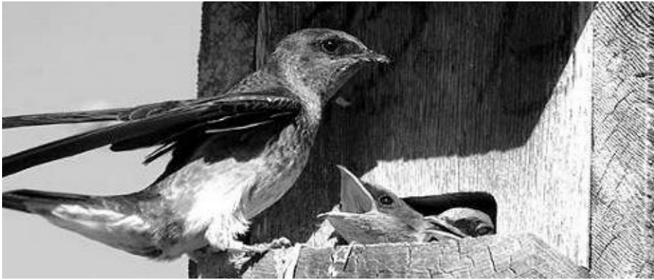
Banding of nestlings, and band reading over several years, has confirmed that young birds are dispersing among colonies. Le marquage et la recapture des jeunes oiseaux au cours de plusieurs années a permis de confirmer que ces derniers se dispersent entre les colonies.